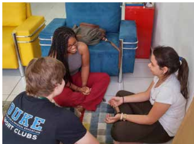
Duke in Brazil students practice their Portuguese language skills with a student from CESUPA (Centro Universitário do Pará) in Belém do Pará, Brazil.